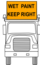
MIDDLE WARNING TRUCK (FRONT OF TRUCK)