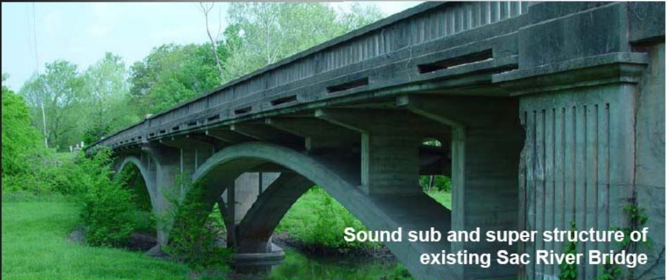
Sound sub and super structure of existing Sac River Bridge

Upon reexamination, District 8 engineers decided to leave the sound (category 6) bridge in place and fix only the deficient geometry. The existing roadway width was also retained.