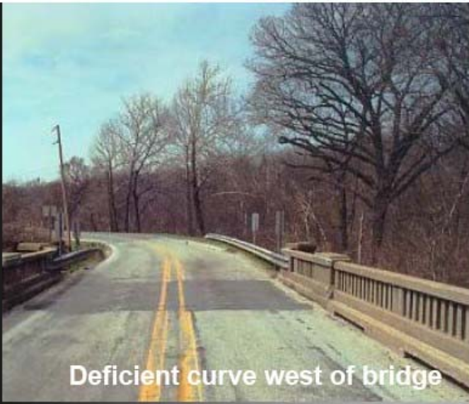
Deficient curve west of bridge

Original Estimate: $4.0 M Redesign: $1.2 M Savings: 70% $2.8 M